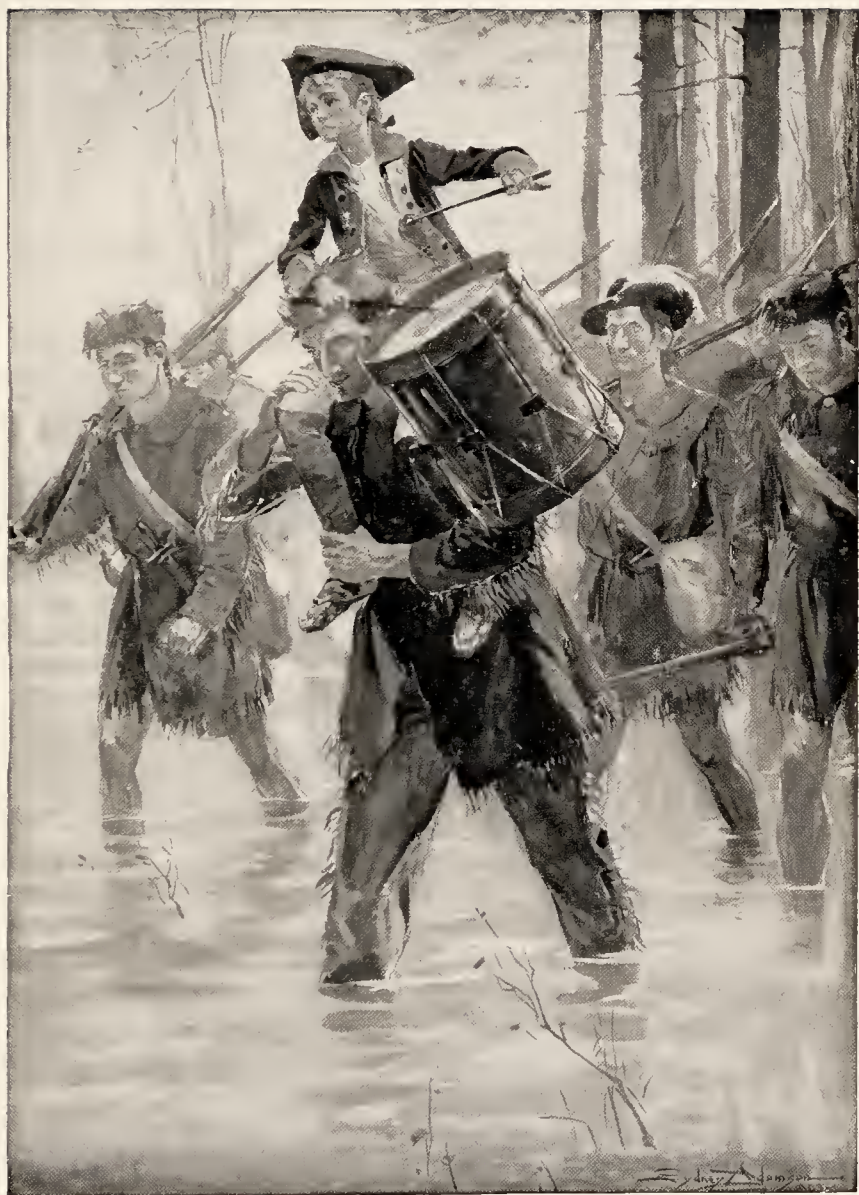
“BEATING THE CHARGE WITH ALL MY MIGHT.”